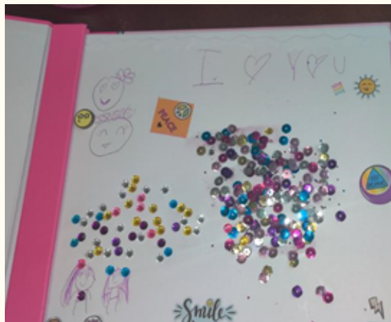
Vision Book Activity for July/2020 - What does friendship mean to you?? Created by a 6-year-old and her mom.

The month of July initiated the start of a new programming year for the Bayside FSC. We jumped right into a new year with many reoccurring initiatives like Zumba, Census Challenges, and our Parent Support group. We also are looking forward to some new initiatives like "Craft with Us" - a virtual activity in which the Bayside FSC staff and Americorps Members have already delivered the crafting tools to our local families. The "Craft with Us" is very dear to our hearts. It was created to help inspire hope and perseverance in our families. The idea of this activity is to help families, adults, and children of all ages come up with ideas and goals via a vision book we have supplied. Craft with Us launched on National Friendship Day 7/30/2020 and will be an ongoing series with a different theme every month.